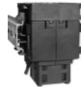
DIN rail clip 1.37 inch ( EN 50022)