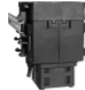
DIN rail clip 0.6 inch ( EN 50022)