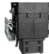
G - rail clip ( EN 50035)