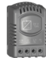
AC / DC power supply