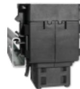
G - rail clip (EN 50035)