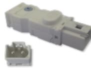
Wieland male connector part no. 400703